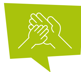
Children in care

In each subject you will see what you have told us in your answers to the Big Ask survey. After that I will explain what I think needs to happen to make things better and help you achieve your goals.