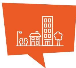
Children and community